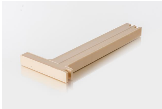
Dielectric rail for fuel cells