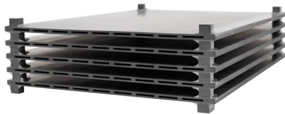
One-layer SiC heat exchanger